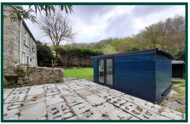
Seating Area and Studio